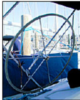
Mounted out-of-the-way on bimini frame.