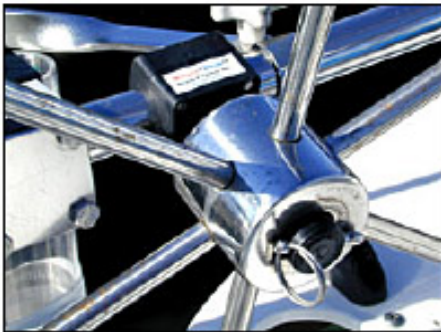
Closeup of wheel hub mounted on Wheel-Dock™