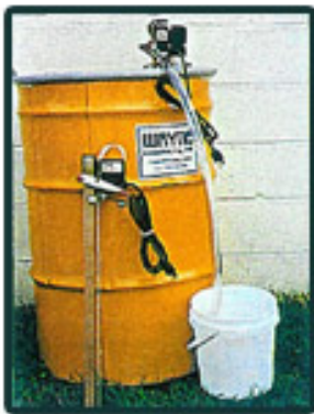
SMB "Skinni-Mini" fits into 2" bung holes!