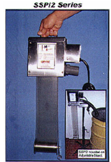
Collection Rates from 7 - 38 LPH (2-10 GPH)

SSP/2 Series MAXI-Skimmers™ collect 2.5, 5.5 or 10 gph and are the most popular of the series due to the low cost and collection rate. Standard units are "off-the-shelf" in 115 or 220 vac. All are fitted with a handle for lifting/portability and a 3 ft. outlet hose extension. Custom units can be built with DC motors, "steep side" discharge for sticky, viscous oils, heaters, etc.