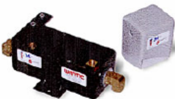
Optional Accessories for 1" wide belt Mini-Skimmers™. Gravity Oil/Water Separator provides 100% oil & recycles host fluid. "Splashguard" slip on motor cover protects motor from liquid splash.

Wayne Products...Manufacturers of Oil Skimmers, Blowers and Filter/Ventilator Systems