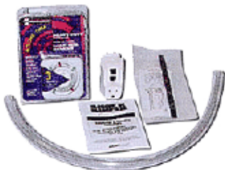
Accessories provided with MSB-A Series. Timer, Ground Fault Interrupter, Handle Kit and Outlet Extension Hose.