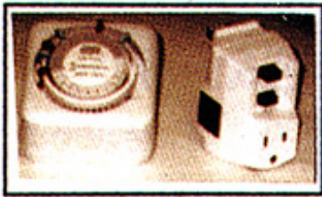
MSB-A System includes Timer, GFI, Handle and Trough Extension Hose!

Mini-Skimmers™ with stainless steel belts have all stainless metal parts (gearmotor excepted). The belt scraper is UHMW bearing-grade polymer to minimize wear. Drive pulley is glass reinforced nylon. Standard units reach -8x, 12x 18x or 24x down from the mounting base. A stabilizer bar for the tail pulley is included - helpful in turbulent tanks! The motor is covered with a stainless sheath-type cover and is provided with a 6 foot cordset. 115/1/60 is standard.