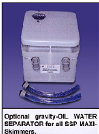
Optional gravity-OIL WATER SEPARATOR for all SSP MAXI-Skimmers.

The "Affordable & Unusually Adaptable" Belt Oil Skimmer! The SSP/2 Series is a modern design made to address the ever increasing needs for WASTEWATER APPLICATIONS. It is priced to be affordable, is lightweight, portable and corrosion-proof! Polyurethane or stainless steel belts can reach from a few inches to 20 feet down. The SSP/2 accepts 1", 2" & 4" wide belts. A timer, ground-fault interrupter, 3 ft. extension hose and handle are included with standard products. Custom units with a "steep trough" side discharge for heavy oils are available as are units for 2" and larger monitor wells.