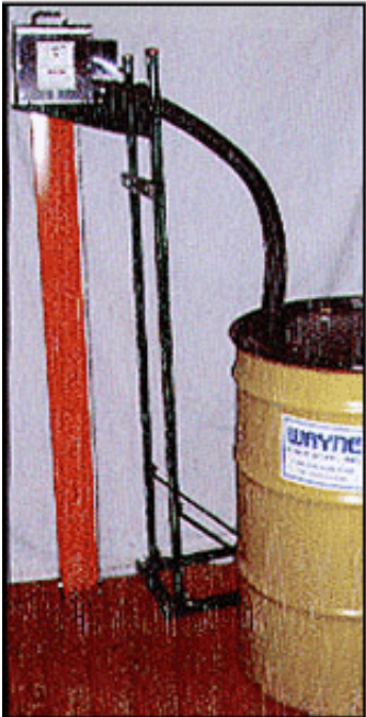
Model SSP/2 mounted on Adjustable Stand (#30823). Stand allows height adjustment from 1 ft.-5 ft. so collected oil can be discharged in a drum or pail.