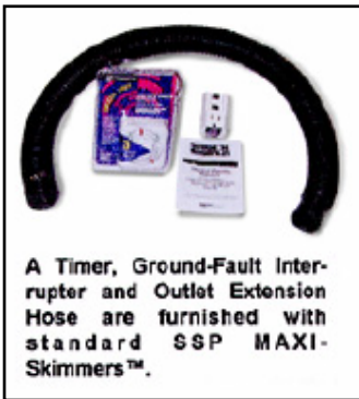
A Timer, Ground-Fault Interrupter and Outlet Extension Hose are furnished with standard SSP MAXI-Skimmers™.